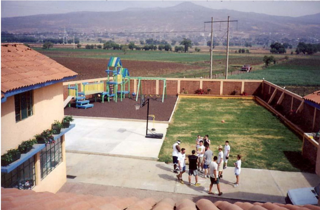
The Mission grounds as a visiting group gathers in the courtyard