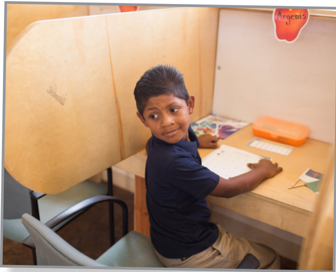
A typical ACE work station