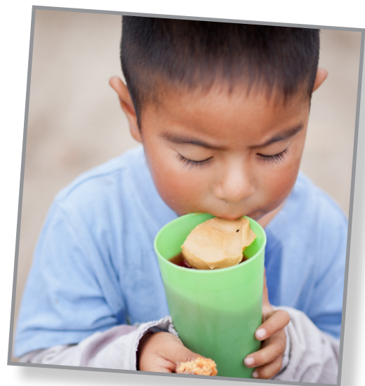
A scoop of peanut butter and milk