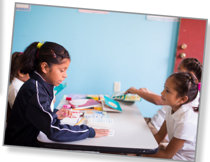
In the classroom

The cost of this wonderful curriculum is approximately $150. Contributions are gratefully received.