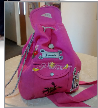
The finished product