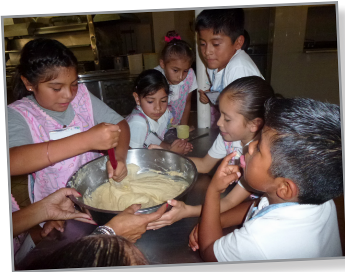
Having fun baking