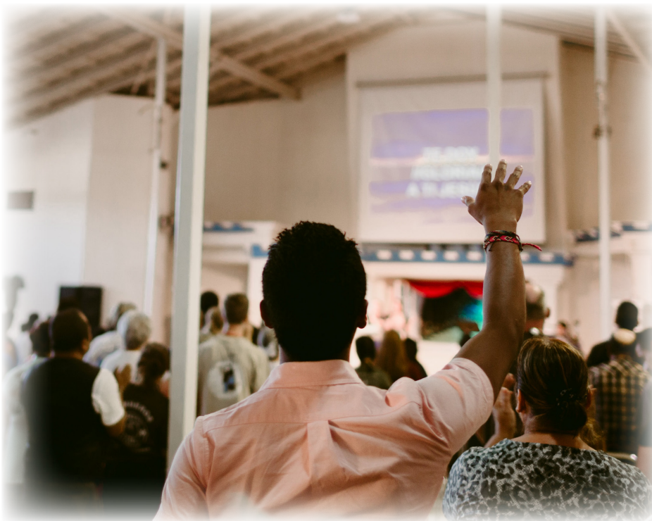
The Mission Church, Baja