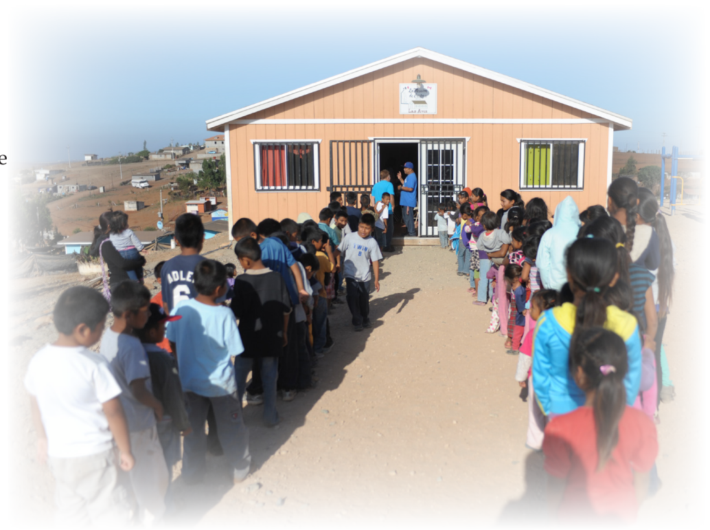
The Breakfast Club

Specialized ministries at the Baja Mission include Disabled Children's Learning Center. They are transported daily and are trained in life skills. Some are going on to higher education.