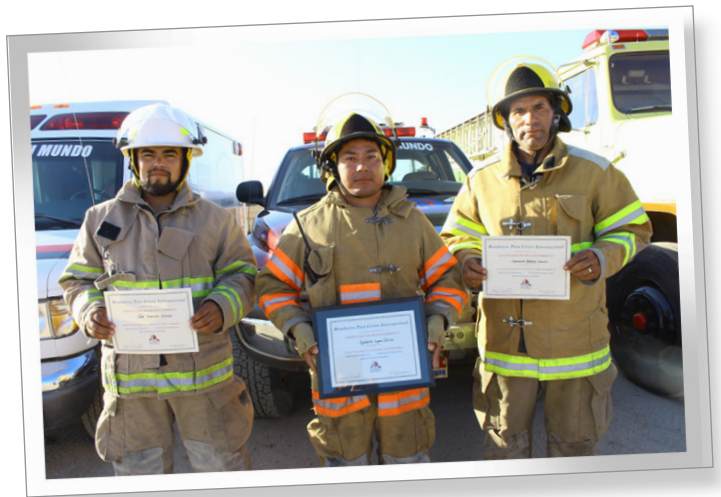
Firefighters receiving a reward