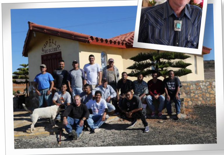
Rancho de Cristo - Men's rehab center