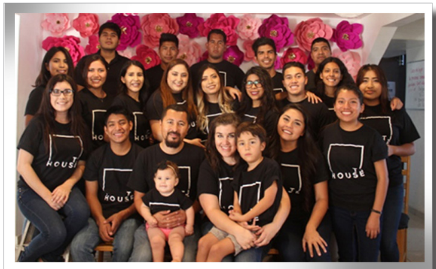
TJ House family

I am also studying French and Mexican Sign Language. I hope to continue studying Sign Language and be an interpreter one day.