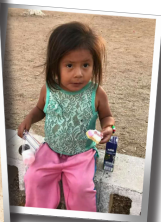
His little one