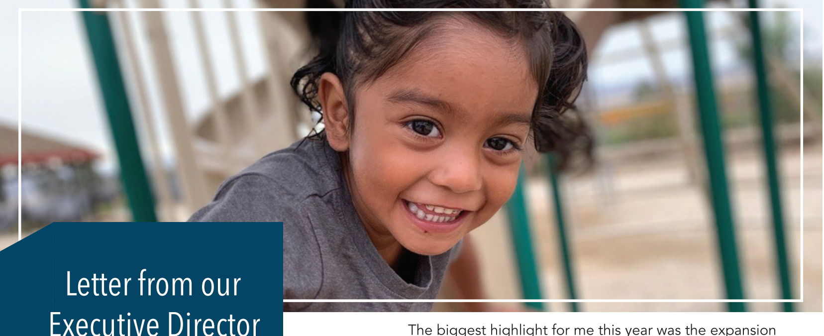
Foundation for His Ministry - Transforming communities in Mexico starting with kids.

If you had told me at this time last year about the pandemic, I would have had a hard time believing you. I didn't have the context to imagine a quarantine. I couldn't imagine canceling visitors to our missions for most of the year, canceling beloved traditions like Night in Bethlehem, and having board meetings over Zoom instead of in person. But this is the reality in which we find ourselves. And that is the reality most of the world is living in.