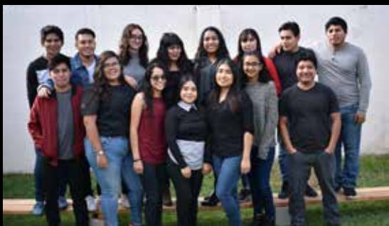
College, University, Tech School