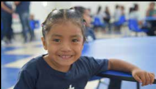
San Quintin Daycare