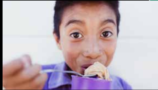
Milk and Peanut Butter