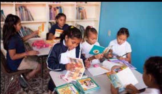
School Uniforms, Books and School