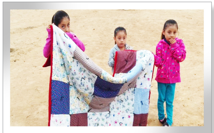
Giving blankets in the camps