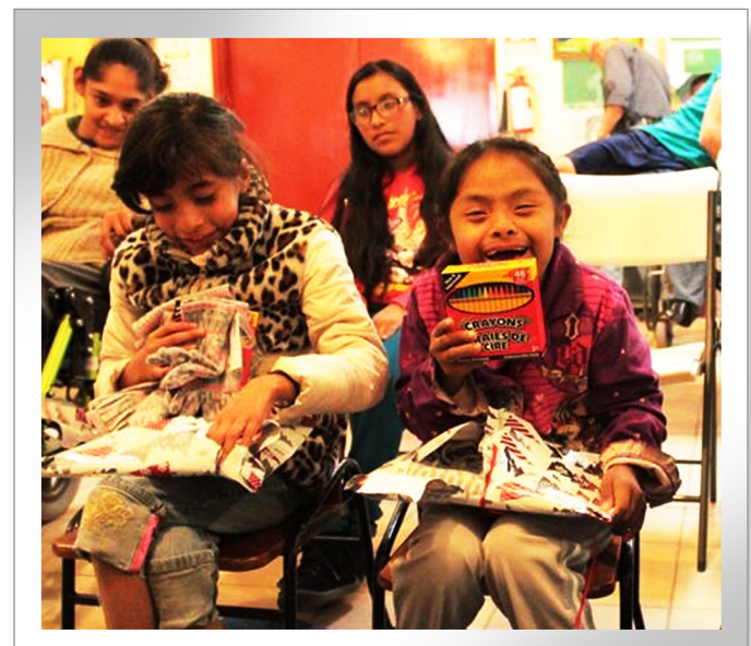
Disabled Children’s Learning Center

The staff and children of Strathcona Academy have raised funds for building and equipping a computer lab for all our children at the Baja Mission.