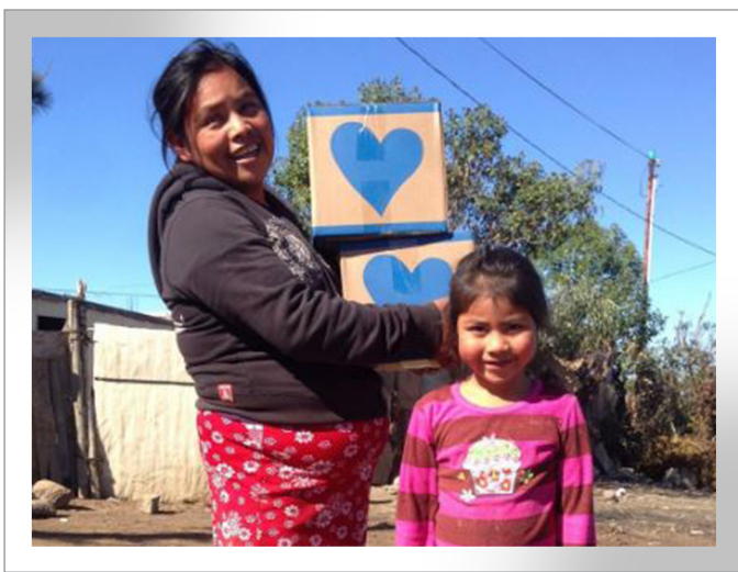
Distributing boxes of food from Children's Hunger Fund to single moms

Without your support, none of this could be accomplished.