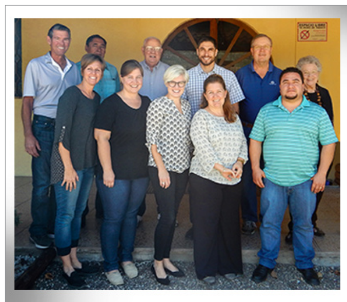
FFHM Board Members and Leadership