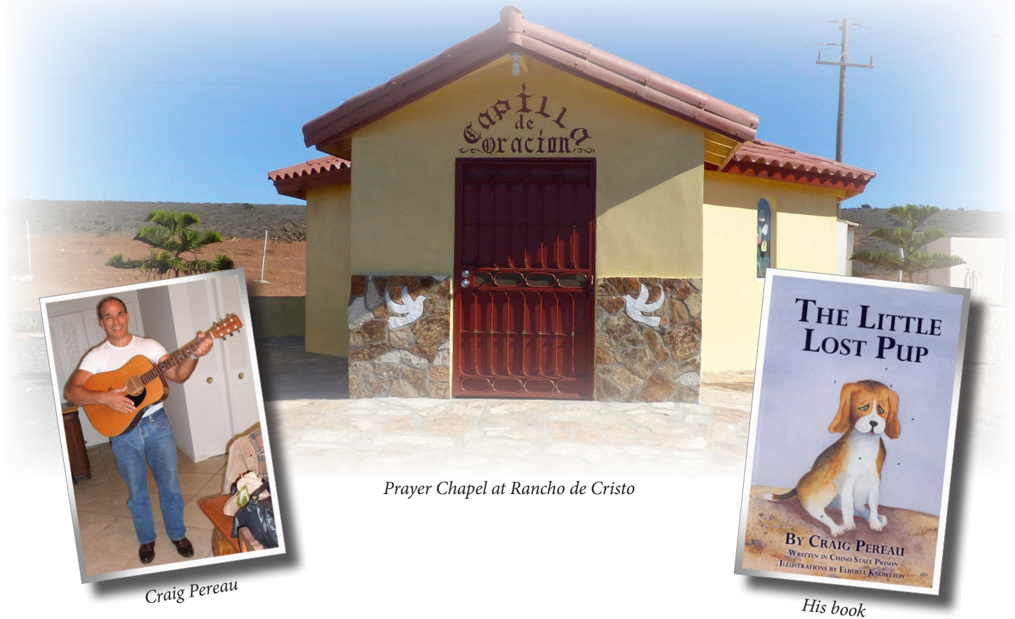
Prayer Chapel at Rancho de Cristo